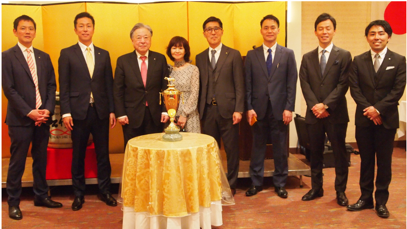
This June, the Japan Racing Association celebrated the 30th anniversary of its New York office