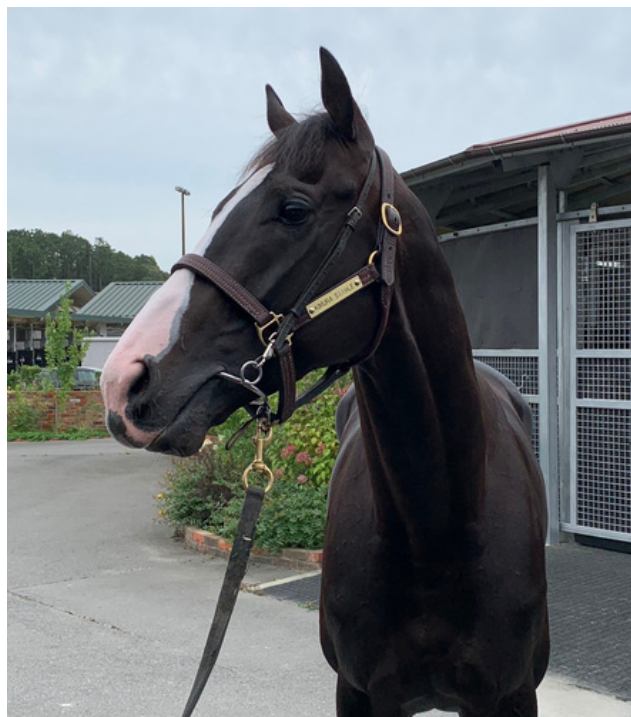
Equinox is currently the highest rated racehorse in the world

It is difficult to train a horse with consideration of the long transportation, especially when we expect a lot of attention from the racing media and fans. Especially this time, I didn't want to have an excuse for such a matter. I felt strongly that I had to respond to the expectations of the people around me to the fullest extent.