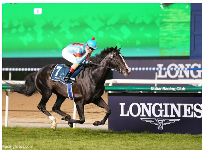
Equinox earned his rating of 129 in the Longines Dubai Sheema Classic (G1)

A: Although I have not directly felt it myself, I think that the international reputation of Japanese horses has been on a global level over a long period of time. The experience that Japanese horsemen have accumulated over decades of challenging races overseas is finally bearing fruit. I have heard various experiences from my seniors, and I think that the accumulation of these experiences has led us to where we are today. In that sense, I feel that Equinox did not just appear out of nowhere.